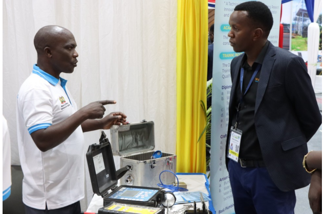
Moments during Water Sanitation and Investors Conference (WASIC) held at KICC.