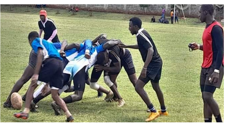
KEWI participates in rugby and football games held at The Kenya Institute of Surveying and Mapping (KISM).