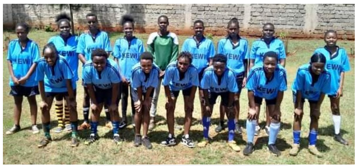
KEWI's women football team.