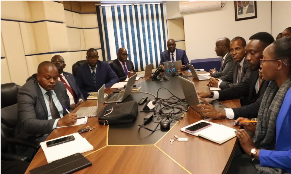
KEWI Deputy Directors and Heads of Departments during the meeting .